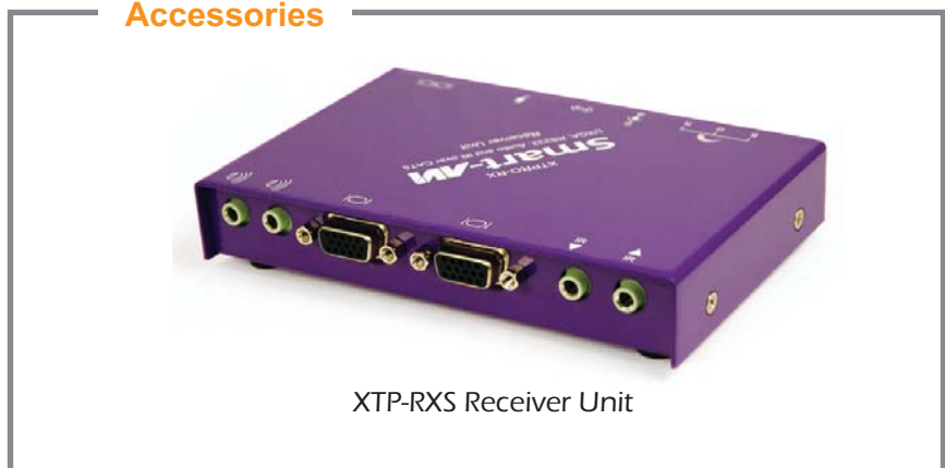
XTP-RXS Receiver Unit

Many leading businesses have already recognized the innovation of SmartAVI's technologies and have eagerly implemented them. Users of SmartAVI technology include among others;